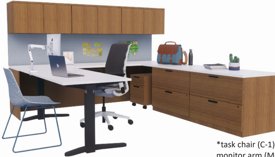
*task chair (C-1), guest chair (C-2), and monitor arm (M-1) tagged as separate line items