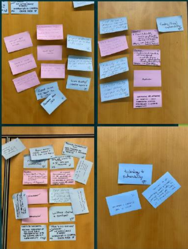
Planning and Technology Committee Meeting post-it comments